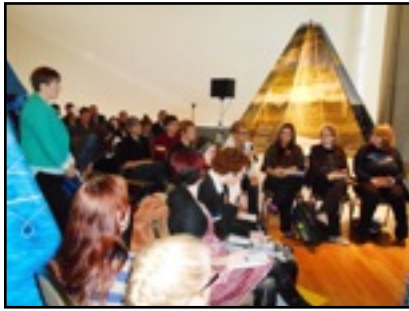
Fireside chat with Symons lecturer the Honorable Paul Martin

The 2013 Thomas H.B. Symons Lecture on the State of Confederation Series was presented by former Canadian Prime Minister, The Right Honorable Paul Martin, on the topic "Confederation Today and Aboriginal Canada." As in past years, Mount Allison’s Centre for Canadian Studies organized student travel to and participation in this important lecture event. The Centre’s commitment to the lecture has earned it the generous support of Charlottetown’s Confederation Centre, which provides bus transportation to and from Charlottetown, lunch upon arrival, and the opportunity for Mount Allison students to meet with the lecturer over a fireside chat following the public lecture. This is a unique experience which has allowed up to 45 Mount