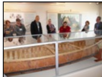
Conference participants at Fort Beauséjour- Fort Cumberland, Aulac, NB.